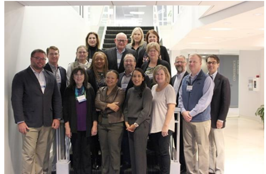
Members of CSG's Occupational Therapy Interstate Compact Advisory Group