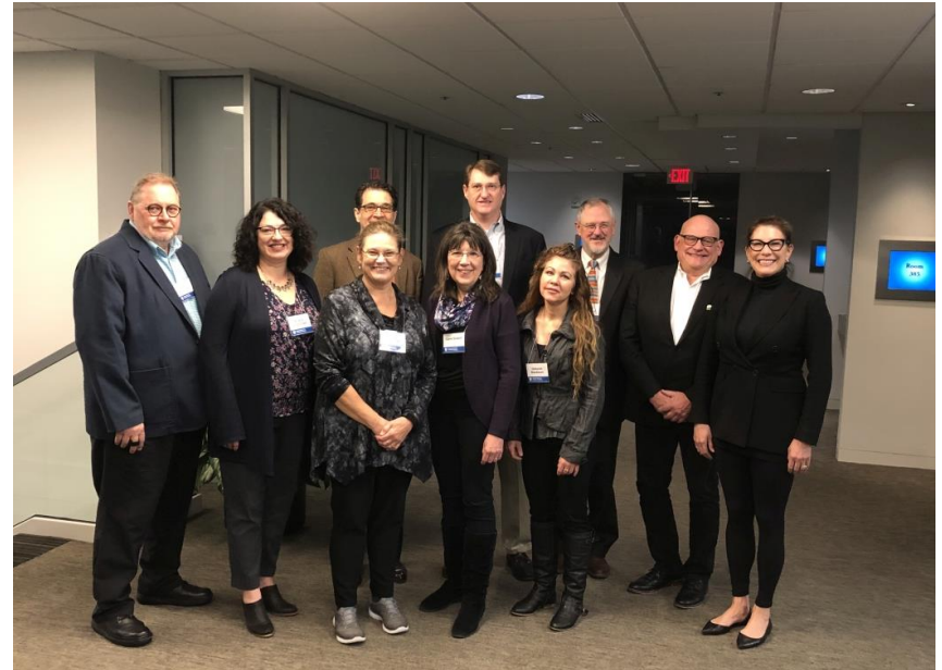
Members of CSG's Occupational Therapy Interstate Compact Drafting Team